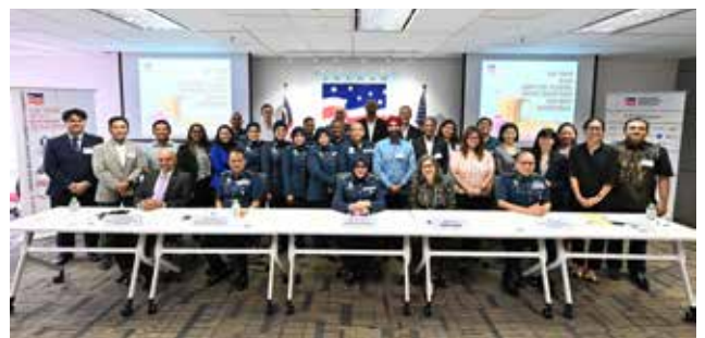
Teh Tarik with the Director-General of the Royal Malaysian Customs Department