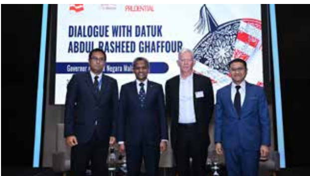
Dialogue with Datuk Abdul Rasheed Ghaffour, Governor of Bank Negara Malaysia