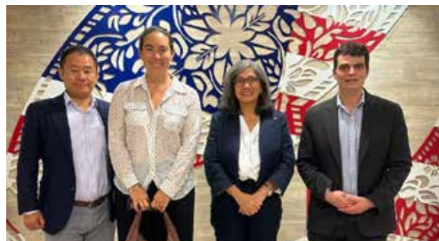
U.S. House China Select Committee Delegation Briefing