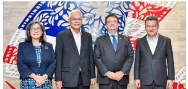
The Future of Semiconductor Supply Chain Resiliency