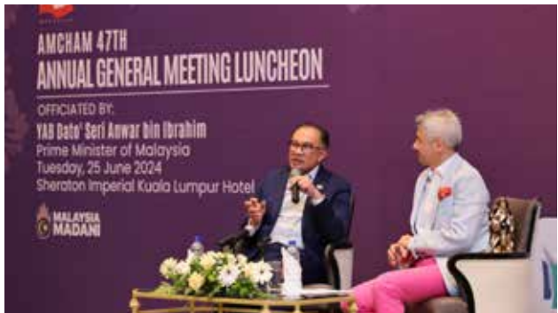
AMCHAM 47th Annual General Meeting Luncheon