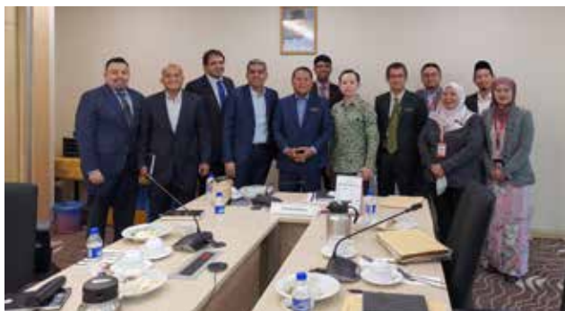
AMCHAM Meeting with the Ministry of Economy Malaysia