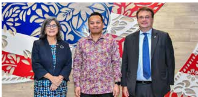
Critical Mineral Business Forum: The Opportunities for Malaysia