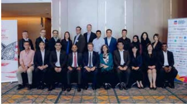
Penang: Welcome Back Reception & MAEI Meeting