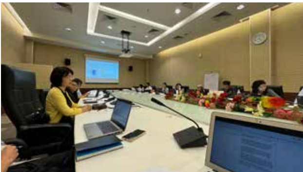
Meeting with IRBM on E-Invoicing