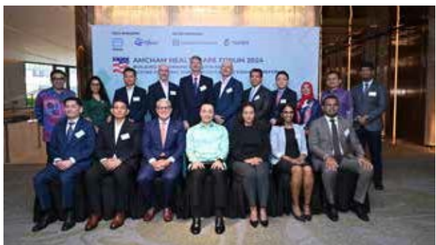
AMCHAM Healthcare Forum 2024 – Building Tomorrow's Healthcare: Future-Proofing Through Digital and Financial Reforms