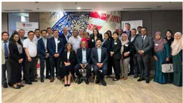
Cloud Services & Data Centres Roundtable with YB Tuan Gobind Singh Deo, Minister of Digital