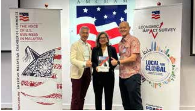
Local for Global: Economic Impact Survey (EIS) 2022/23 Launch