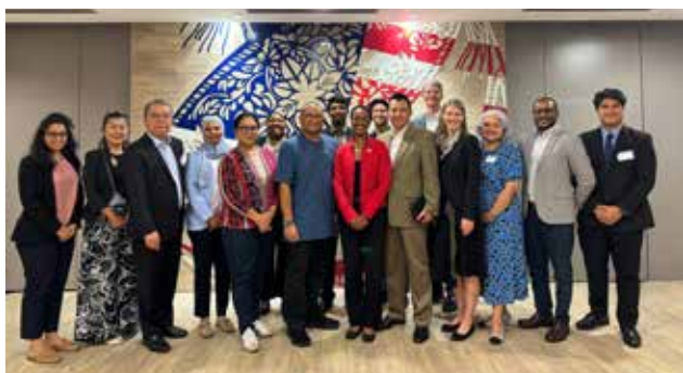
AMCHAM x USTDA Digital Roundtable in Malaysia