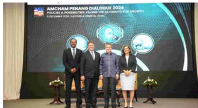
AMCHAM Penang Dialogue 2024 – Policies & Possibilities: Paving the Pathways for Growth