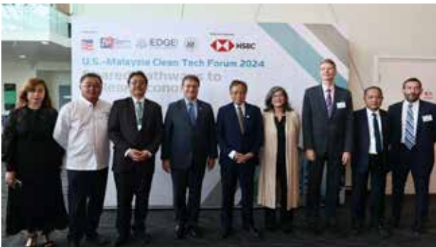
Malaysia Clean Tech Forum 2024: Shared Pathways to Clean Economy