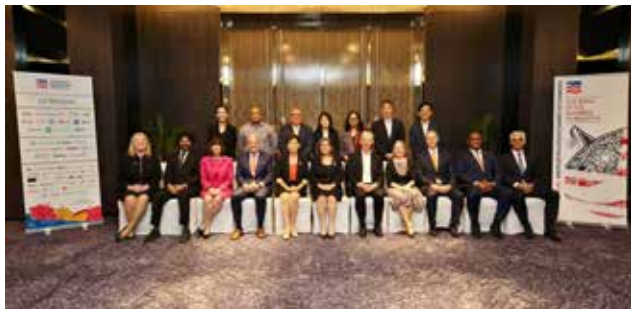
AMCHAM Luncheon with U.S. Congressional Delegation

As we look ahead to 2025, with Malaysia assuming the ASEAN Chair, AMCHAM is eager to support efforts to strengthen regional integration, promote sustainable economic development, and enhance Malaysia's role as a strategic hub within ASEAN. We remain committed to advocating for policies that drive growth, facilitate trade, and position our members for long-term success in an increasingly interconnected global economy. Together, we will continue to build a more dynamic and prosperous future for Malaysia and the broader ASEAN region.