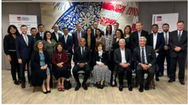
Roundtable with U.S. Treasury Under Secretary Brian Nelson