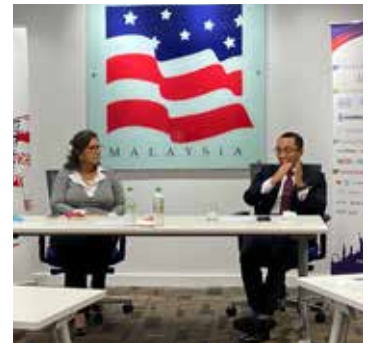
AMCHAM Luncheon with the Minister of Home Affairs and the Director-General of the Immigration Department of Malaysia