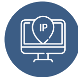
IPv6 Working Group