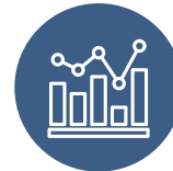
Tax & Investment Working Group