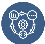
Business Continuity Plan Working Group

Working groups come together from time to time to work on specific issues and concerns. These can be elevated or incorporated into Committees once leadership and missions are defined and agreed upon.