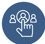
Human Resources Working Group