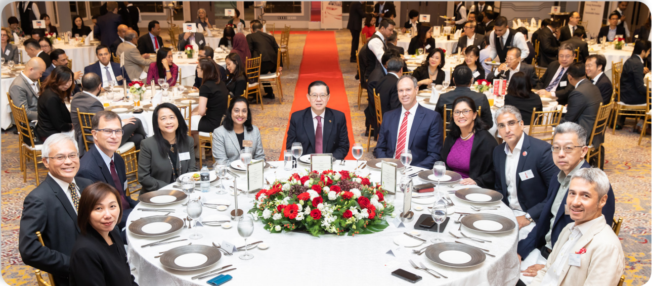
Budget 2019 Luncheon with Y.B. Tuan Lim Guan Eng, new Minister of Finance