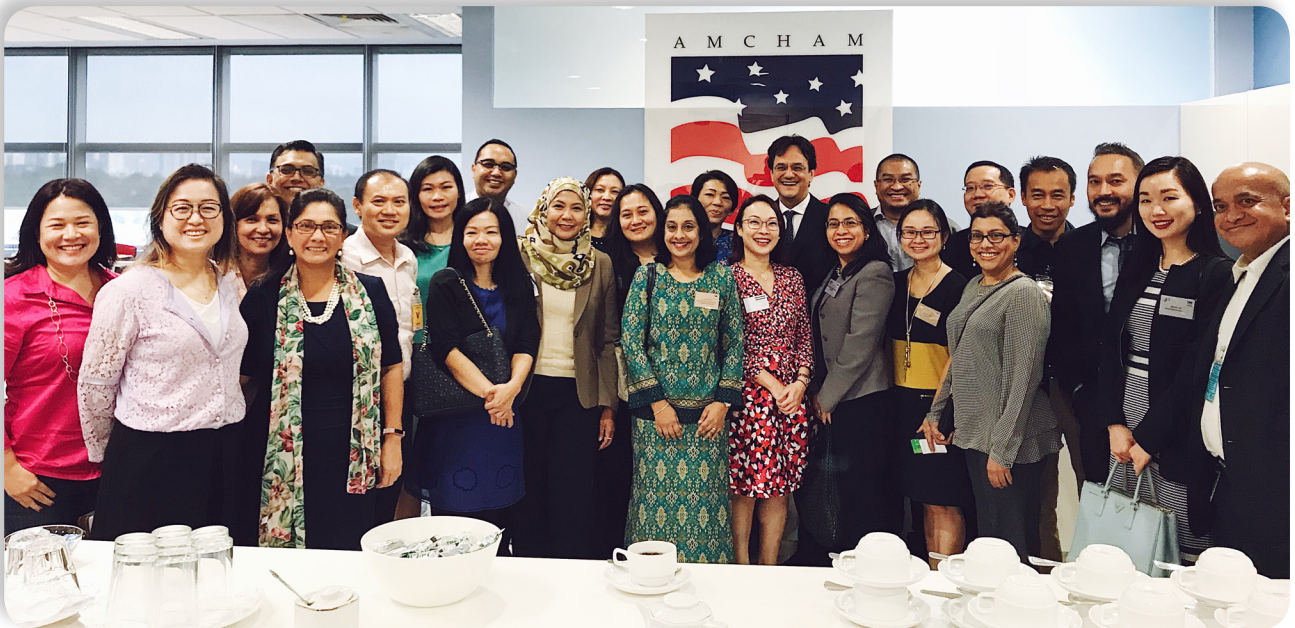
The New Malaysia: First 100 Days with Karim Raslan