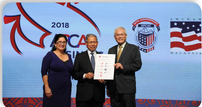
Formal Presentation of the AMCHAM Economic Impact Survey (E&E Sector) 2017 / 2018