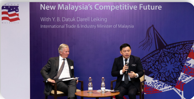
VIP Luncheon with Y.B. Datuk Darell Leiking, new Minister of International Trade & Industry