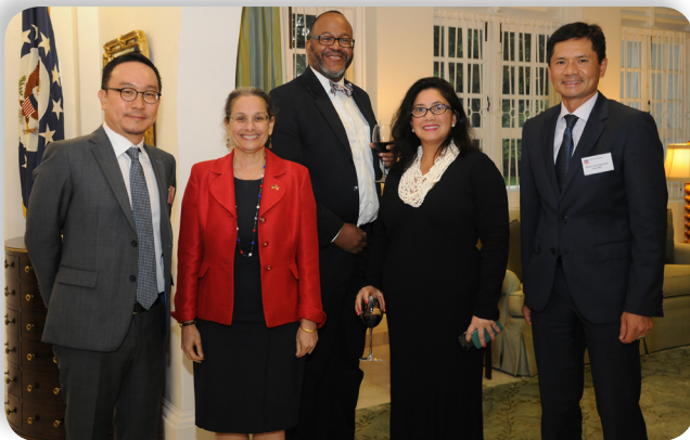
Welcome Reception at the U.S. Ambassador's Official Residence

AMCHAM's profile was greatly raised by the Summit and the Chamber realized not just an uptick in visibility locally, but also from around the region. Social media was integral in covering the Summit; both #APCAC2018 and #PartnersInAsia were trending on Twitter over the two days. Coverage included over 100 media mentions and 22 videos clips were shared on various platforms.