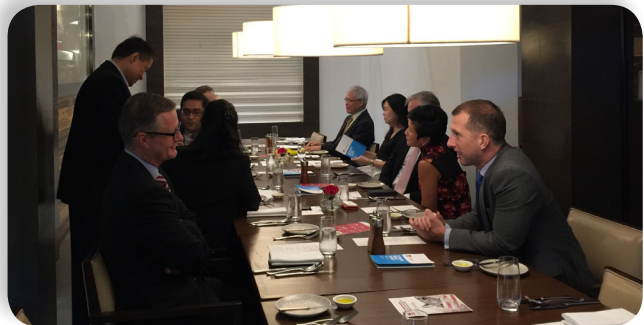
Board of Governors Luncheon