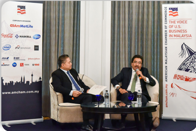
Malaysia in 2018 with Y.B. Datuk Seri Johari Abdul Ghani, former Second Finance Minister