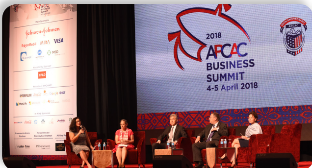
Beyond Borders Panel Discussion with U.S. Ambassadors