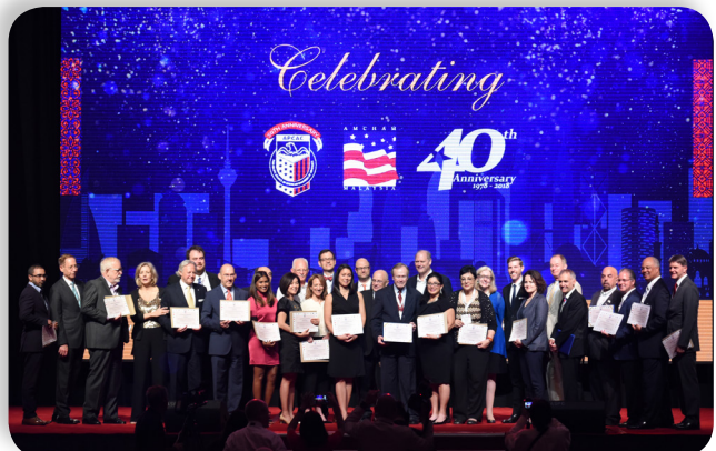
AMCHAM's 40th and APCAC's 50th Anniversary Dinner