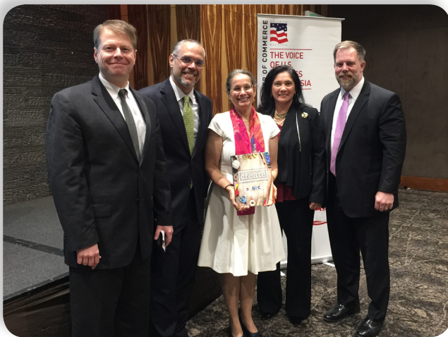
U.S. Chamber's Global Intellectual Property Center International IP Index Launch in Malaysia