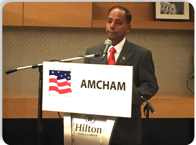
VIP Dinner with Y.B. Tuan M. Kulasegaran, new Minister of Human Resources